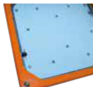
Osram® LED Technology

Example applications include petrol stations, manufacturing plants, chemical and petrochemical processing facilities, sewage treatment plants, offshore and dockside installations.